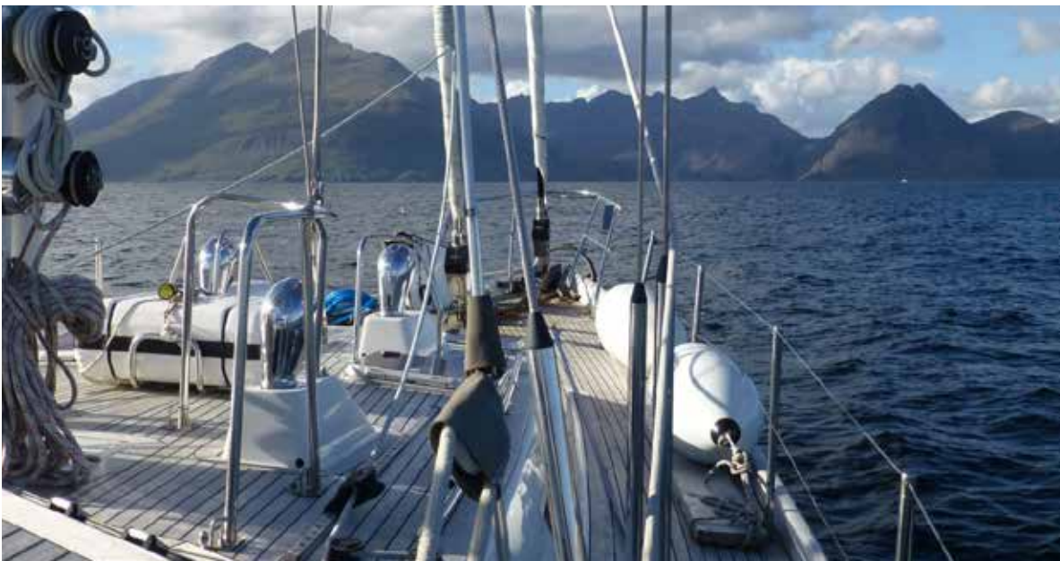
MOONSHADOW YACHT CHARTER LTD

With no less than five of the Munros that make up the iconic range within walking distance, this is your chance to scale peaks that dreams are made of – raw, rugged, and brutally beautiful. Take care, however; many Cuillin summits require scrambling or rock-climbing to reach and can challenge even the veteran Munro-bagger. There are several shorter walks that still provide spectacular views, while